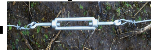
Fig 2: Turnbuckles