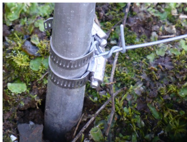
Fig 1: Bottom pole connection