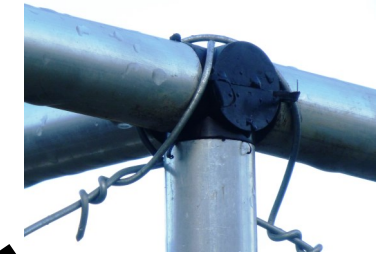
Fig 3: Top connection